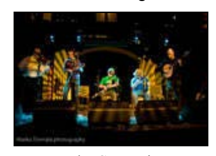
The Soap Pig

The Festival Work Group would like to thank the City of Oulu Culture Department, Culture Ireland, the Irish Embassy, our supporters and sponsors, local media, musicians, volunteers, and especially the fans all who made the festival such a huge success.